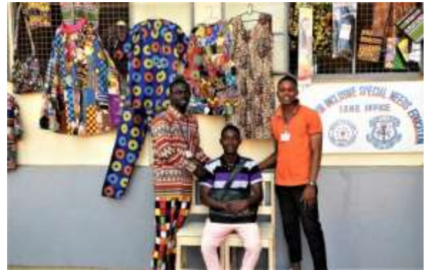
The Woodwork Centre students sitting on chairs that they had made.