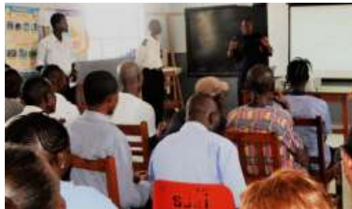
Staff attending theory part of the training.