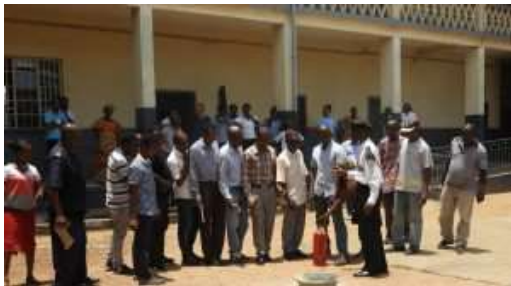
Staff taking turns on putting out fire.

We are happy to report that we have had smoke detectors, alarms and fire extinguishers installed throughout the school by the Makeni City Fire Force. On Tuesday, two senior fire officers conducted fire prevention training for all staff – night carers, watchmen/security, catering, administration and teachers, in total 56 staff attended. The training was very comprehensive and included theory and practice. You can see some videos on our Facebook page.